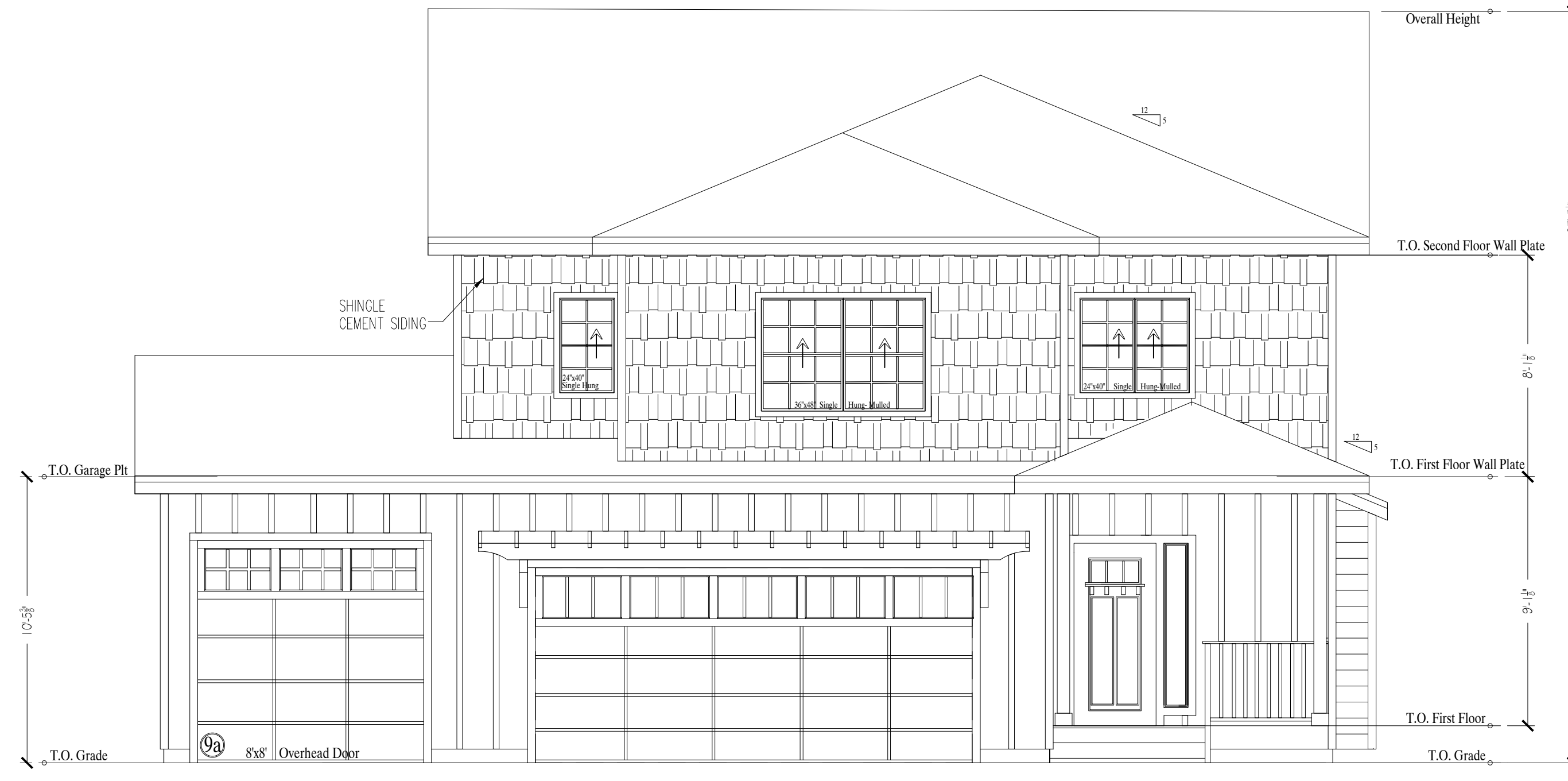
B FRONT ELEVATION (OPTION #2)