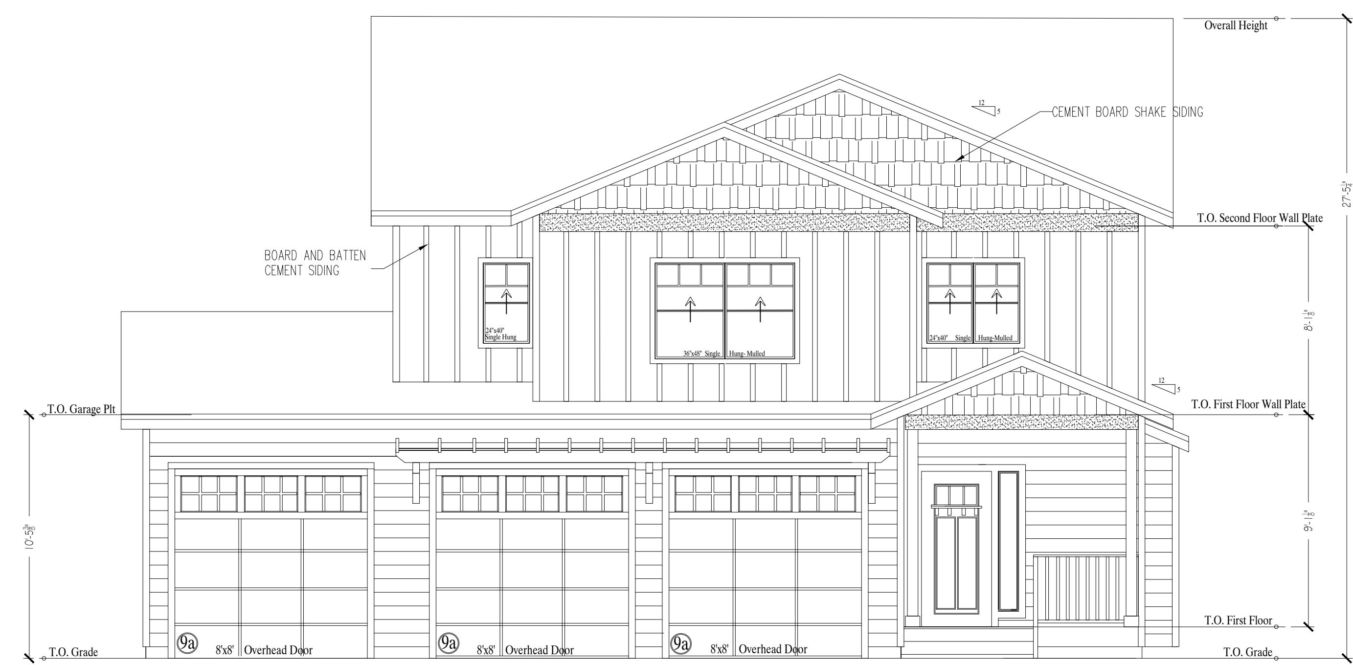
A FRONT ELEVATION (OPTION #1)