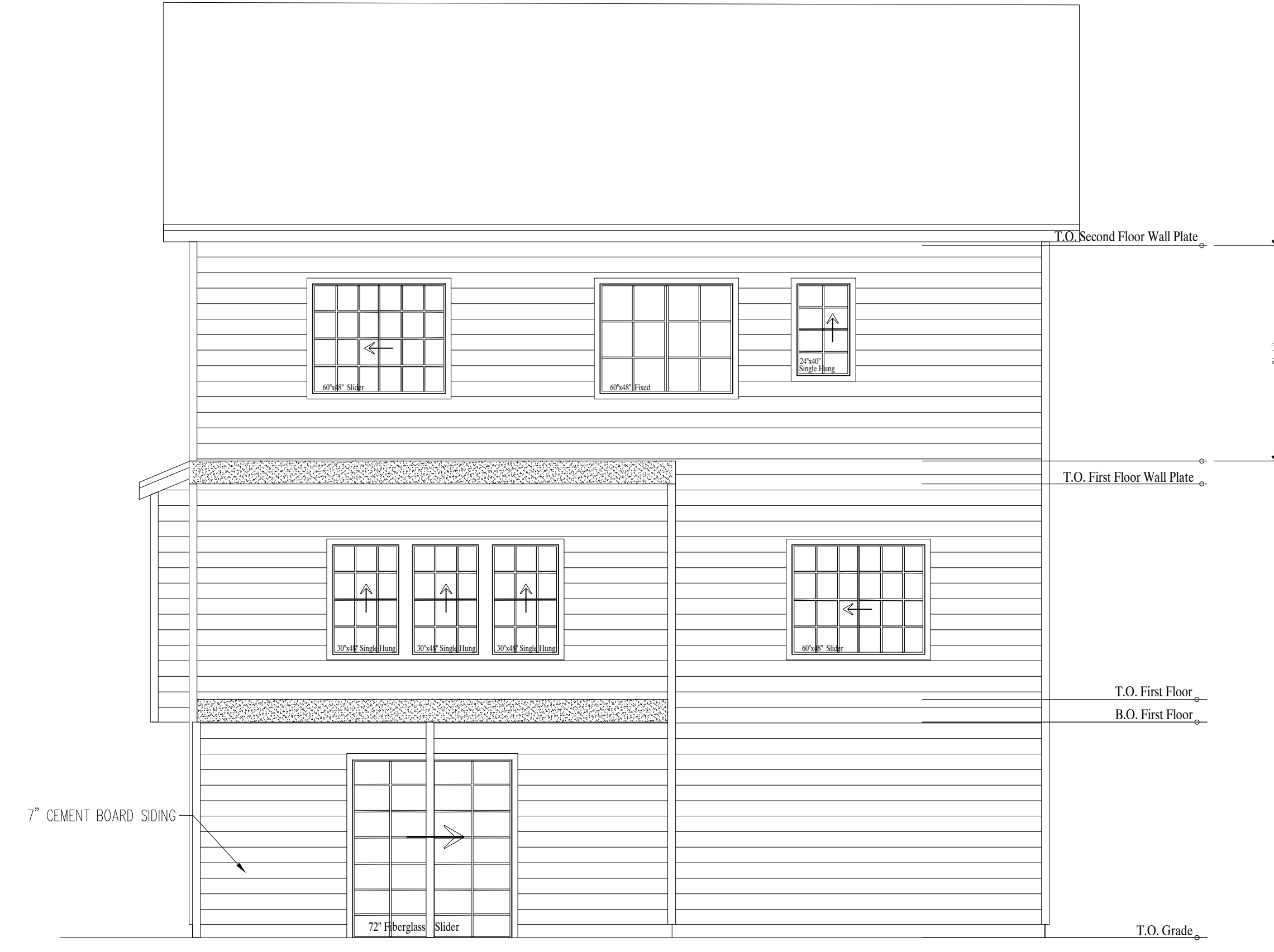
B REAR ELEVATION (OPTION #2)