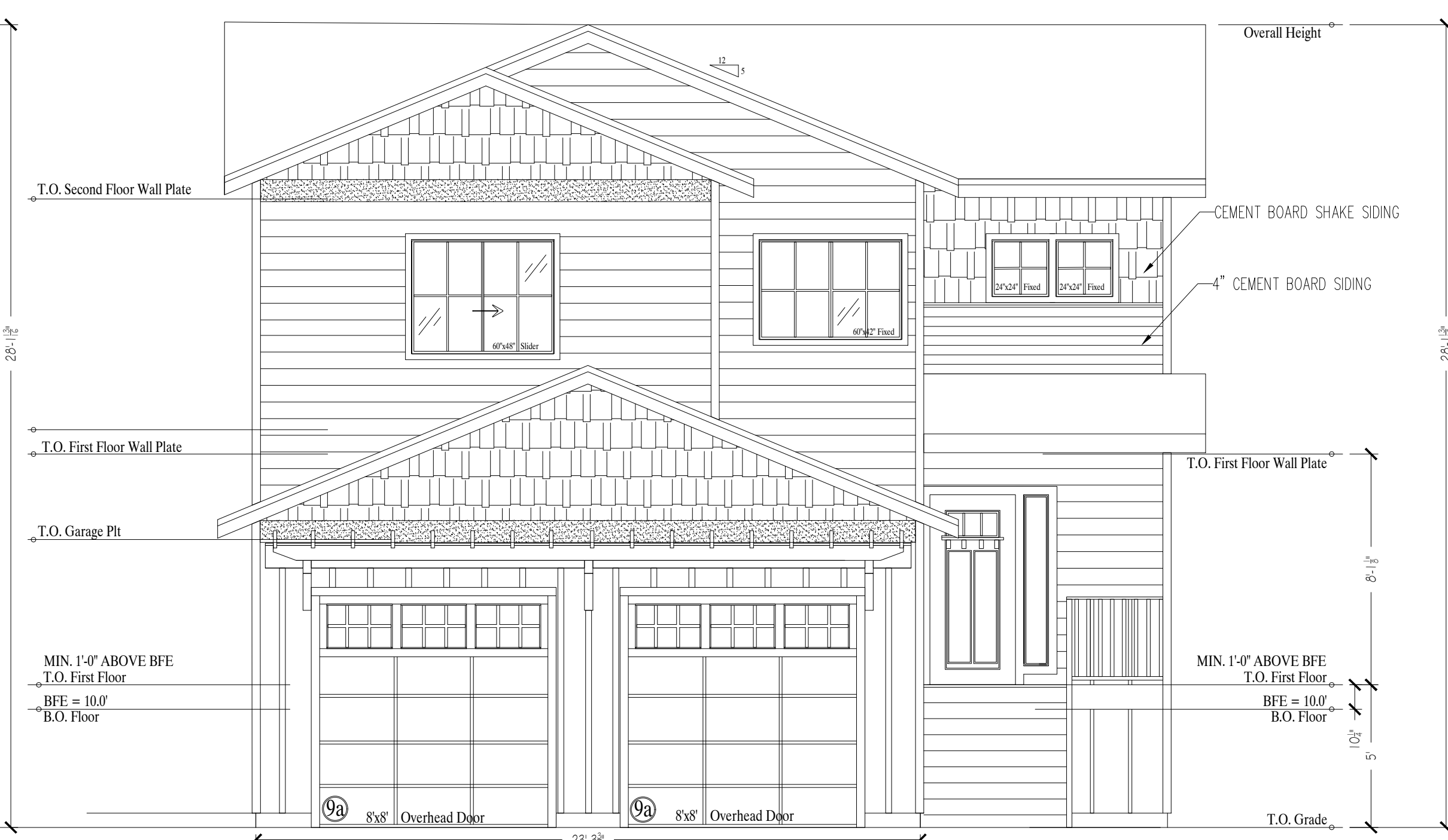
A FRONT ELEVATION (OPTION #1)